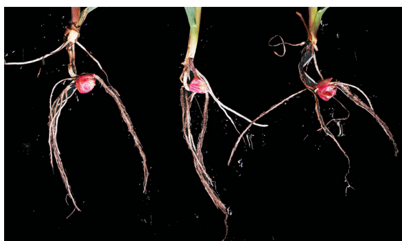
CruiserMaxx Vibrance Corn